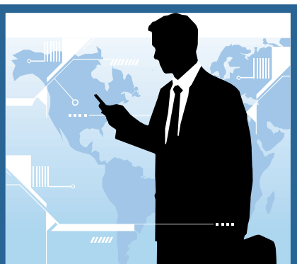
General steps to ensure successful business sales or purchase transactions include a letter of intent ("LOI"), due diligence, definitive documents and a closing.

referred to as the "definitive agreements." The primary contract depends on the structure of the transaction, i.e., an asset purchase agreement, a stock purchase agreement, a reorganization agreement