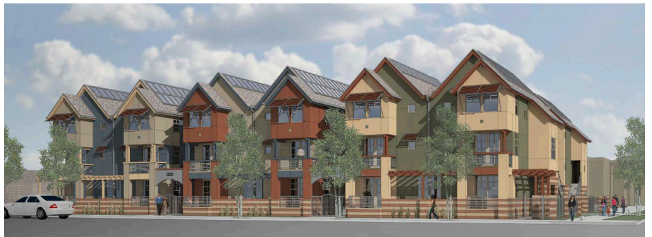
North site (above) and Northwest perspective of La Valentina development project by Domus Development, LLC.