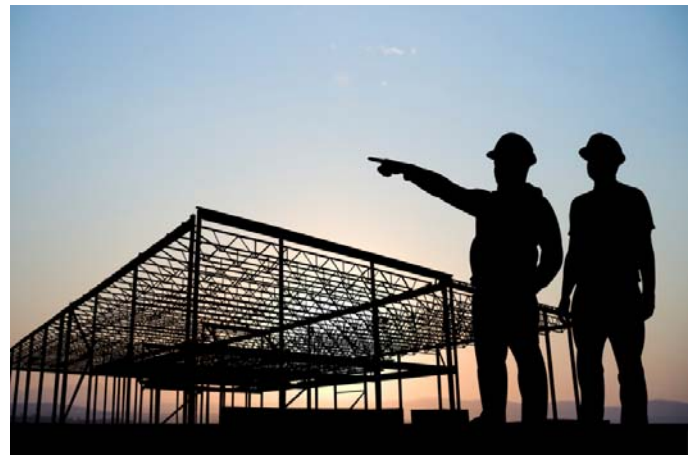
Under California law, oral change orders for extra work on public projects are usually “against the law” and not enforceable.

several weeks to sign and return each change order to the contractor, and the city’s project manager frequently orally authorized the contractor to begin the extra work before it received the signed amendment. The problem arose with respect to another $106,000 worth of “extra work” which the contractor claimed the city staff had approved yet was never reflected in any signed written change order. The parties could not resolve their dispute and the case ended up in court before a jury.